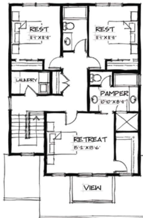
UPPER FLOOR PLAN 1100 SQ. FT.