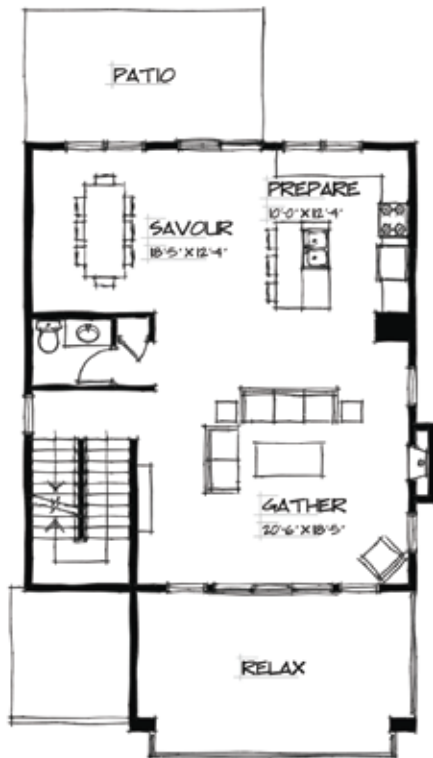
MAIN FLOOR PLAN 1002 SQ. FT.