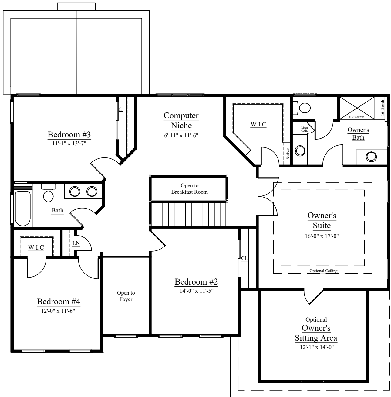
Second floor plan Sq. Ft.: 1560 Total Sq Ft.: 3111

Illustrations and floor plans are artist's conceptual renderings. Details, colors and dimensions are subject to change and field verification. Window and front door locations and room dimensions may vary according to elevation. Mature landscaping not typical. Light fixture locations and window boxes not included.