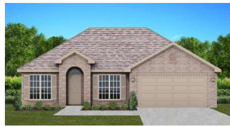
The Willow $253,300