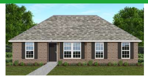
The Charlotte $228,500