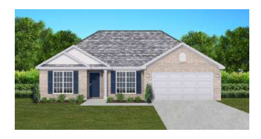
The Magnolia $260,300