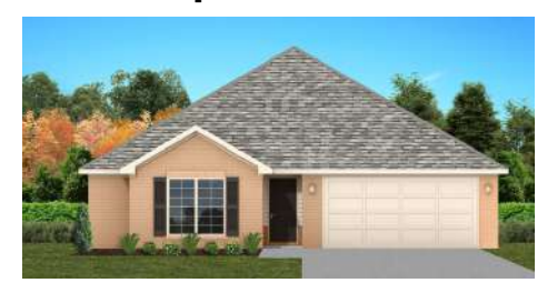
The Birch $259,500