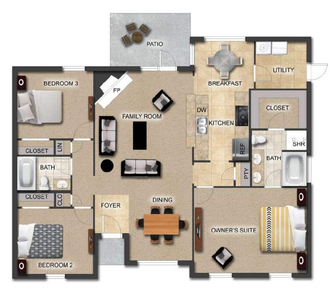
AVAILABLE ON PLAT 2 LOTS 28-39