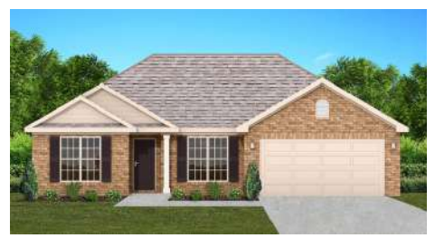
The Savannah $257,900