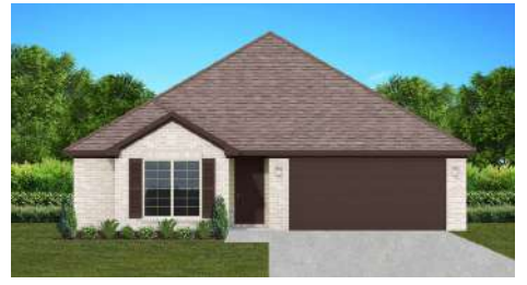
The Aspen $249,900