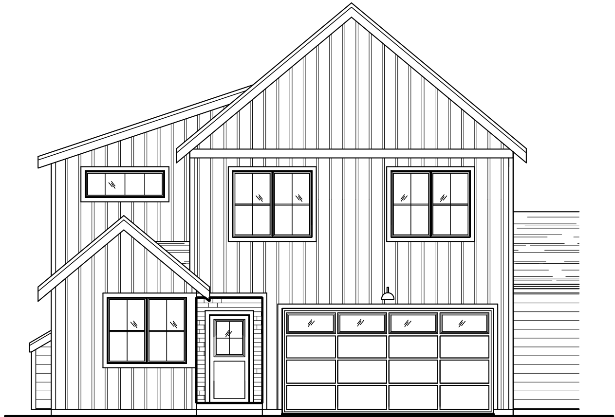
FRONT ELEVATION "B"