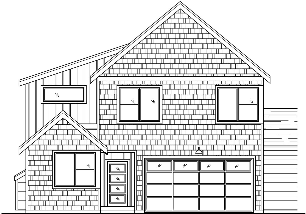
FRONT ELEVATION "A"