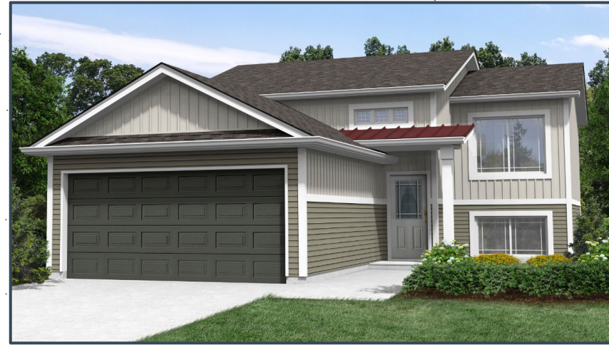
Optional Craftsman Elevation Shown