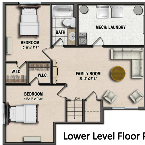
Lower Level Floor Plan

Maximum house width for each new home site Indicated on the Neighborhood map